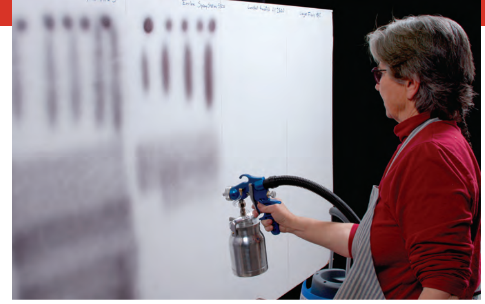
Best test. Masaschi tested each system by spraying dark-colored solvent-based and water-based lacquer onto white cardboard, making it easy to see the size of the spray droplets and the shape of the spray pattern.

adjustment knobs that adjust the spray very nicely.