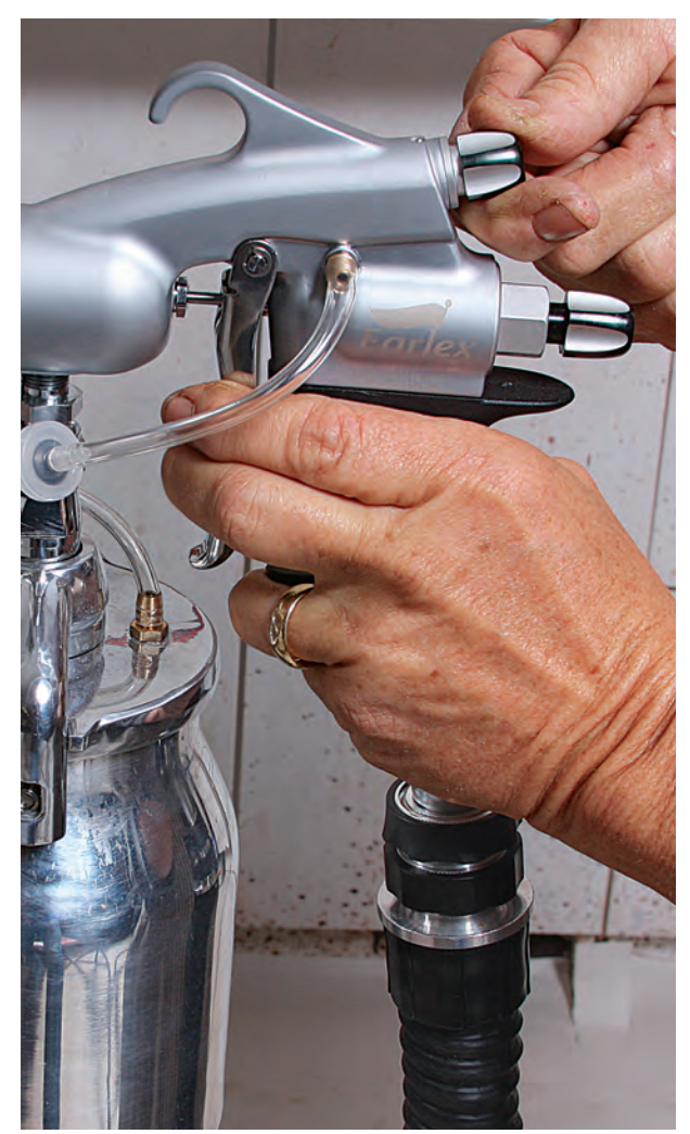
Conventional controls. Many guns have separate knobs that adjust the fluid volume and the air volume, which in turn control the width of the spray pattern. This traditional system, as seen on the Earlex SprayPort, is straightforward.