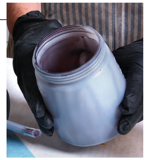
Watch out for threaded cups. The threads, shown here on the Wagner Flexio 890, are difficult to clean, and once they form a buildup of old finish, they become hard to use.