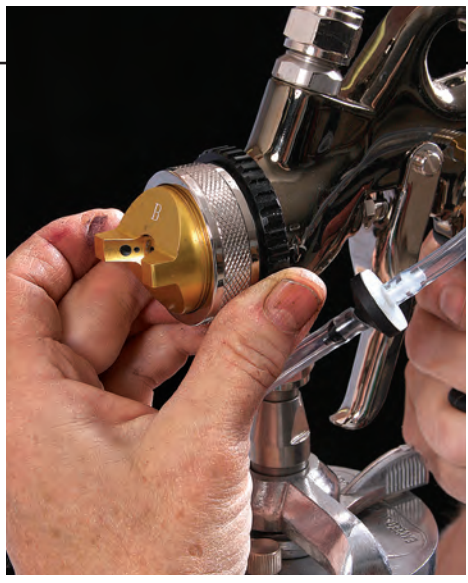
Innovative and easy. The gun from the Apollo 835 Turbospray has a dedicated ring near the front that makes it easy to adjust the width of the spray pattern.