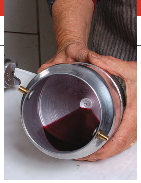
Spit proof. The cup from the Apollo ECO-3/ E7000 system has a cone-shaped bottom, which helps keep the gun from picking up air when the fluid gets low—a helpful feature.

In the end, three systems emerged as Best Overall: the Apollo 835, the Apollo ECO-3 with the E7000 non-bleeder-style gun, and the Fuji Spray Mini-Mite 3. All three had superior quality spray, very comfortable handles, and easy-to-use, ergonomic