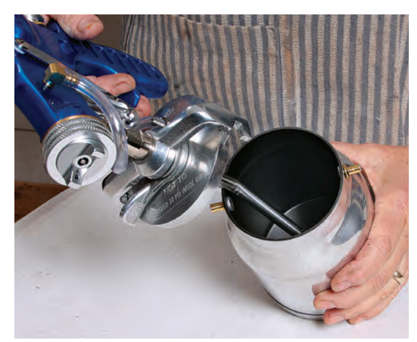
Coating protects. The Earlex SprayStation and the Apollo 835 Turbospray both have cups with a protective coating inside that guards against corrosion.

The SprayPort, the ECO-3 with the E7000 gun, the Fuji, and the Apollo 835 all were simple to adjust, fast and intuitive to figure out, and had overall nice fit and finish, allowing you to turn the knobs with a light twist of the fingers. The controls on these systems also adjusted the spray width from an even, wide pattern down to a small circular one almost effortlessly.