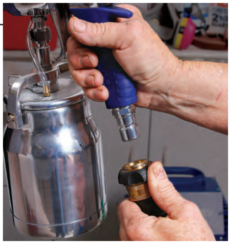
Out of the way. The hose on the Fuji Spray Mini-Mite 3 attaches out of the way at the end of the handle, and has an easy-to-grip coupling that makes it a snap to attach.