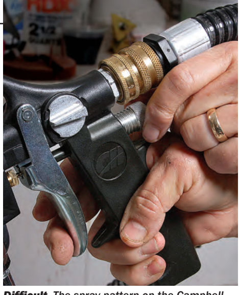
Difficult. The spray pattern on the Campbell Hausfeld guns is adjusted by changing the fluid and airflow knobs in tandem with the air cap. The system made it tough to get a nice pattern.

lacquer and black solvent-based lacquer onto white cardboard. The dark finish allowed me to clearly see the shape of each gun's spray pattern, as well as how fine a mist each gun was able to create. Waterbased lacquer is much safer and more widely used these days, but it's more difficult to split up into a very fine mist, so it was a challenging test for the sprayers.