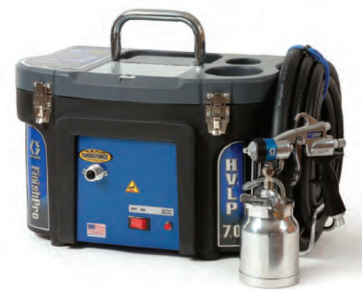
GRACO FINISHPRO 7.0