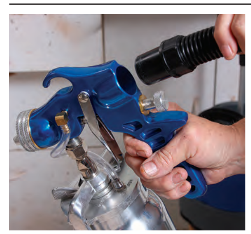
In the way. The hose on the Earlex SprayStation is close to the fluid-adjustment knob underneath, making it harder to turn the knob, and also to spray in tight spaces.