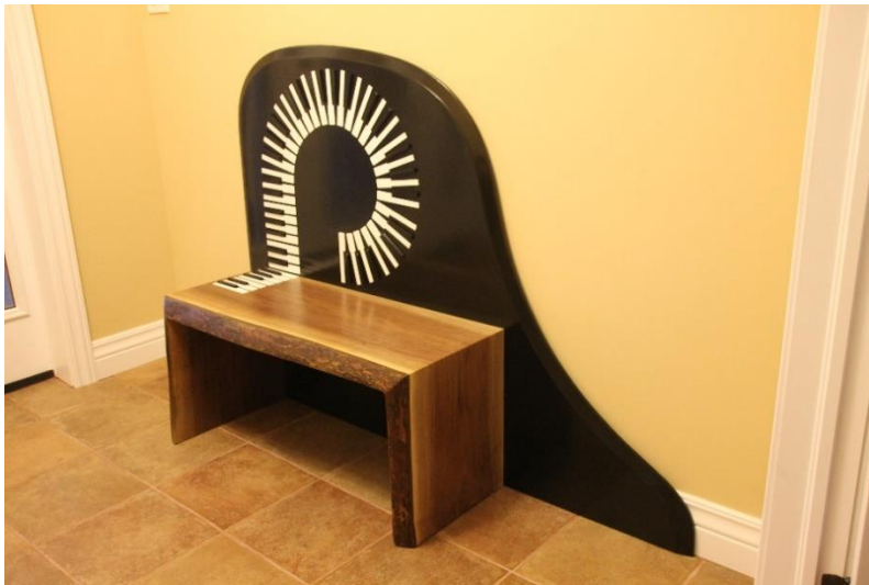
"Just Playin' Round" foyer table. The back is made of parts from his spouse's circa 1902 vintage piano; bench section of walnut. 2018.

Wood Objects juried woodwork exhibition. He is a proud recipient of the Danny Proulx Memorial Award and the founder of the Kingston Wood Artisans Inc. (KWA); https://kwoodartca.wordpress.com/ ). He also established the KWA's bi-annual symposium initiative and his latest endeavor, held on 8 April 2018, was their fifth and most successful to date. Their association also conducts a bi-annual exhibition of finely crafted wooden objects, the most recent of which was held on 6 April 2019 ( https://kwoodartca.wordpress.com/special-events/artistry-in-wood-2019/ ).